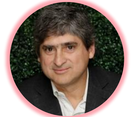
Octavio Gaspar Argentina 2025 – 2030