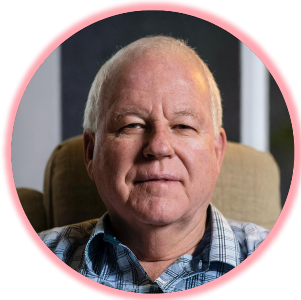
Colin Steenhuisen South Africa Re-elected 2025 – 2027